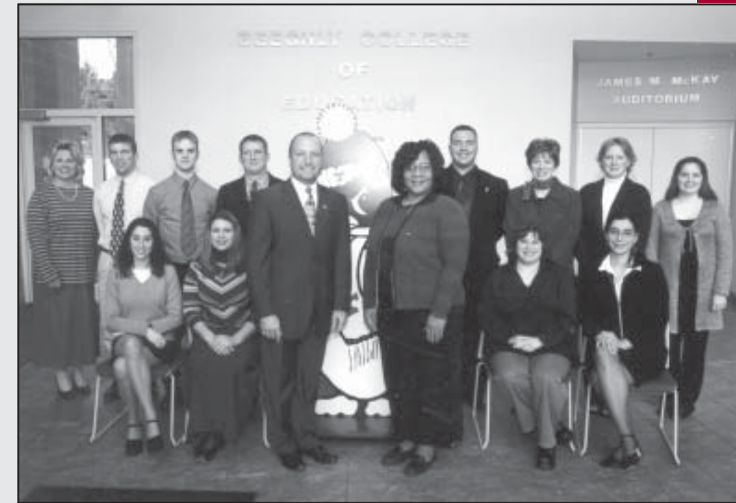
Dean's Dozen 2002-2003